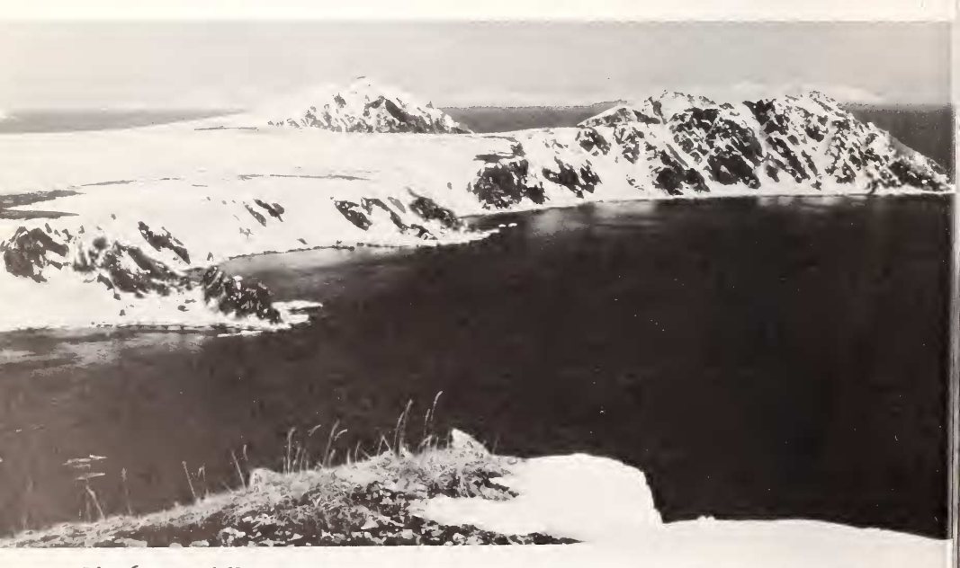
Fig. 6. Sea cliffs south from Cape Peirce with Hagemeister Island in the background, 30 April 1976.

Estuarine bays are generally shallow and contain large beds of eelgrass ( Zostera marina ). At low tide the bays are drained by deeper channels, and considerable areas of mud- and sandflats are exposed. Scattered around the bays are salt marshes drained by tidal sloughs. All of these estuarine areas provide important feeding and gathering spots for waterfowl and shorebirds during migration. Each bay and Hagemeister Strait has one or more long, narrow sandy spits separating the bay from open water. These spits are generally a combination of bare ground